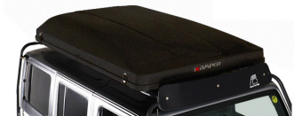
ROCKY BLACK (Matte Finish)