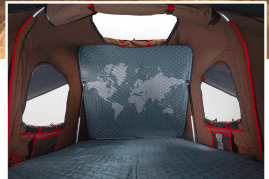
Skycamp Mini opens to a comfy double size mattress.

The tent "skin" is just one part of the Skycamp Mini. It's completely detachable, allowing you to switch it out with our lighter mesh tent in summer or replace the tent after a few years without having to buy a whole new Skycamp.