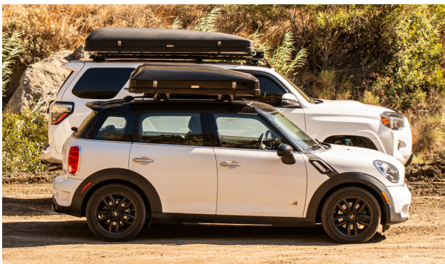
Skycamp Mini with Skycamp 4X size comparison.