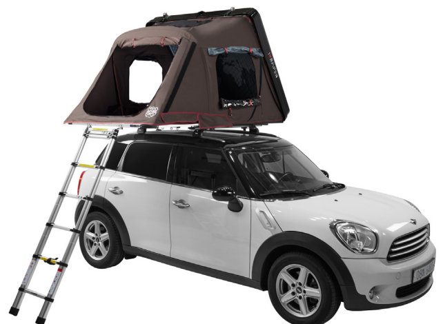
Weighing in at only 57kg (125lbs), the Skycamp Mini can fit on most vehicles: compact cars as well as short bed or truck cabs.