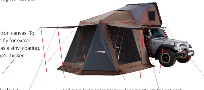
Add more living space to your Skycamp 4X with the optional Annex Room. 100% waterproof 150D polyester material with 3000 PU (Polyurethane) colour coating construction and mosquito netting on all doors makes it perfect for picnics in the heat and rain. (Shown with optional extra canopy poles.)