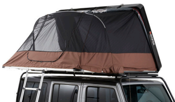
Skycamp 4X with optional Airflow Summer Tent fly open.