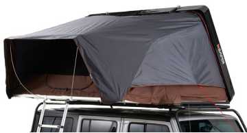
Skycamp 4X with optional Airflow Summer Tent fly closed.

But finally, we did it. We believe you'll be as proud of owning your Skycamp as we are of creating it.