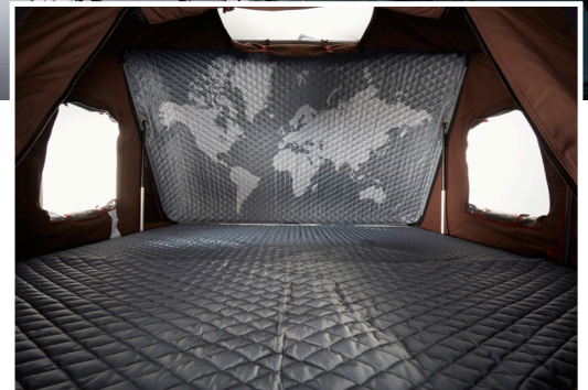
Skycamp 4X floor folds out into a comfy king size mattress.

The tent "skin" is just one part of the Skycamp 4X. It's completely detachable, allowing you to switch it out with our lighter mesh tent in summer or replace the tent after a few years without having to buy a whole new Skycamp. You can also upgrade to one of our limited-edition designs.