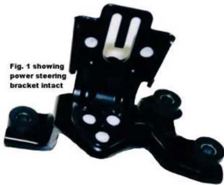
Fig. 1 showing power steering bracket intact