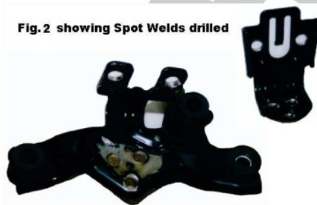
Fig. 2 showing Spot Welds drilled