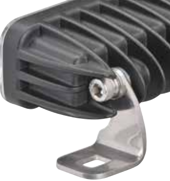
Stainless Steel Brackets